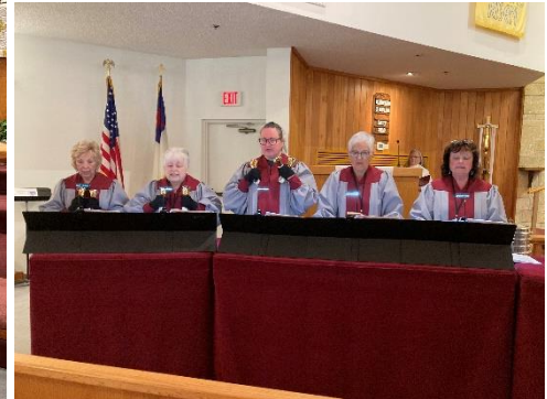
Remember your baptism in worship!